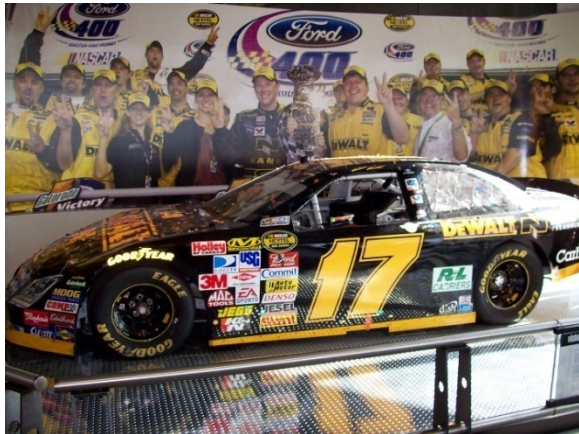
One of the stops from the color run!